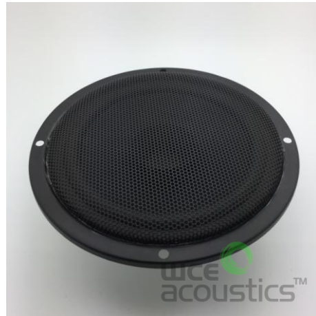
* above photo is for reference only

Vivid voice & High volume - Dual cone with metal housing - Protective front case included - Suitable for Car usage -