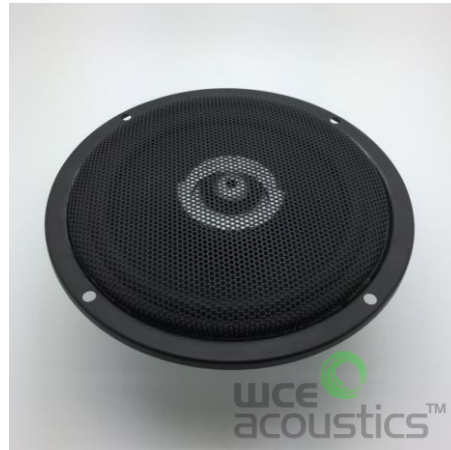
* above photo is for reference only